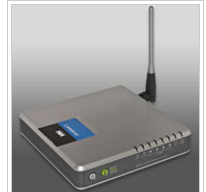
A gateway is commonly used to make an ADSL connection. The model pictured is also a wireless access point, hence the antenna.

At the telephone exchange the line generally terminates at a DSLAM where another frequency splitter separates the voice band signal for the conventional phone network. Data carried by the ADSL is typically routed over the telephone company's data network and eventually reaches a conventional internet network. In the UK under British Telecom the data network in question is its ATM network which in turn sends it to its IP network IP Colossus.